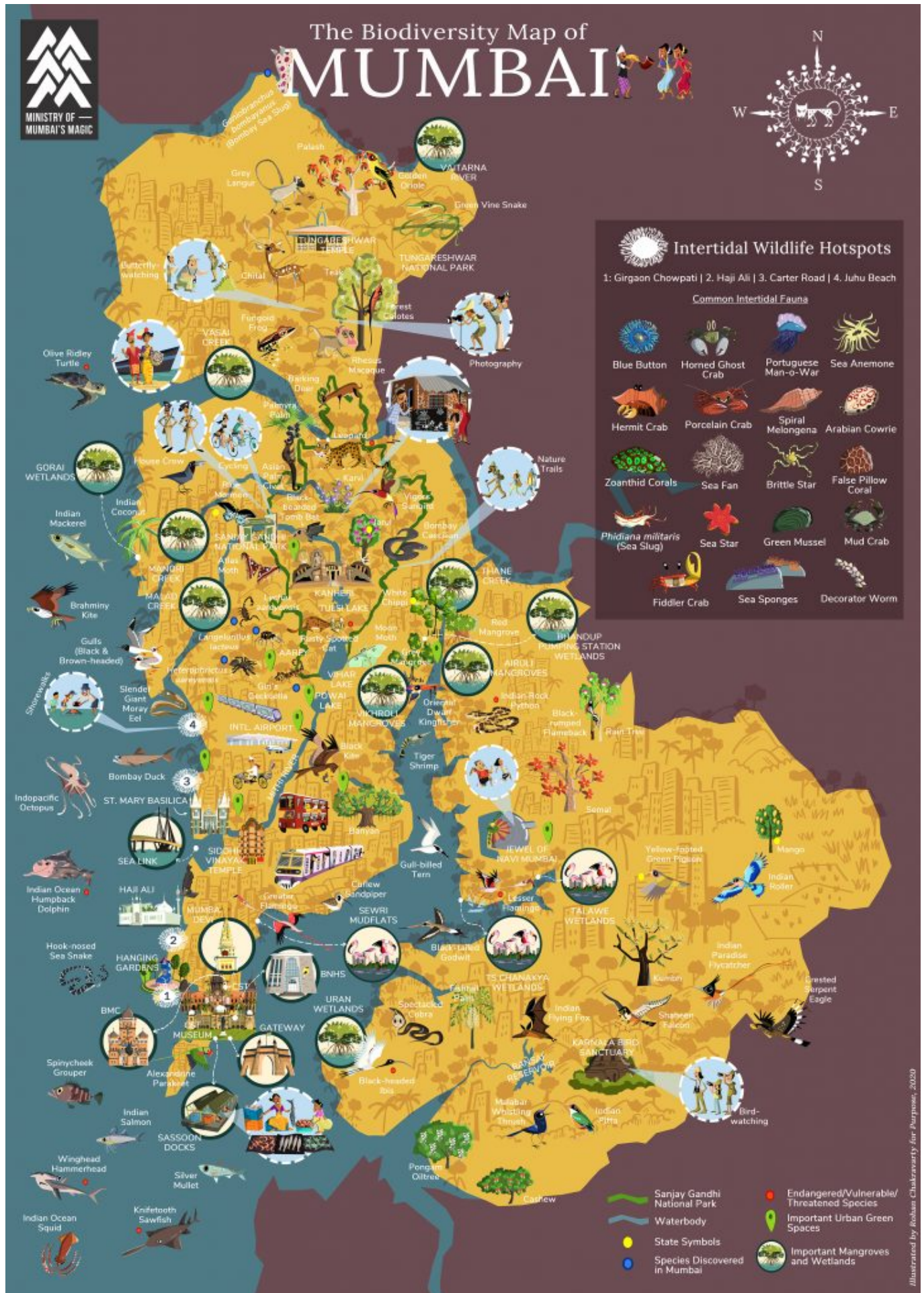
Wildlife in the Maximum City