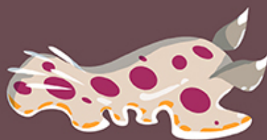
Gonyobranchus bombayanus Bombay Sea Slug