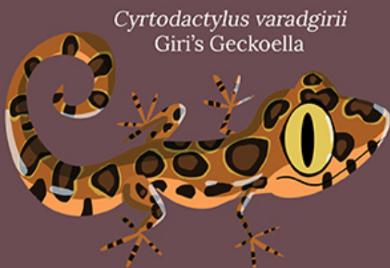
Cyrtodactylus varadgirii Giri's Geckoella