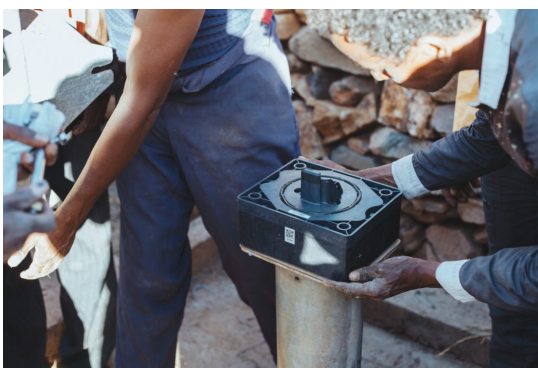
Afrodev sensor installation in progress

Charity: water developed two IoT sensor designs, the Afrodev and India Mark 2 sensors, with Michigan engineering firm Twistthink. They use the capacitive sensors commonly employed in smartphones to sense the position of a user's finger on a touch screen which, in the water point sensors, measure the difference in electrical conductivity between the presence of water, and the presence of air, to sense the activity and efficiency of the water pumps. Microchips store the data and transmit it, via IoT carrier deals with local mobile phone companies, to charity: water's New York head office, but also local charity and government partners such as NEWAH in Nepal, who use the data to coach locals to repair water sources in the field. The data can also be used to contract local companies to maintain sensors, with a clear picture of the work involved and its timings. It was important to Gorder and his team that the devices had a long battery life, as additional maintenance of sensors "would raise more issues than it resolved".