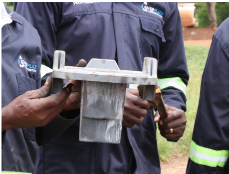
IndiaMarkII testing Uganda

were field testing their fourth-generation pump in Uganda's Apac district when they received data that the sensor was recording water flow 23 hours out of 24 (in other locations pumps tend to lie fallow from around 11pm to sunrise).