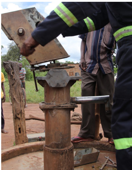
India Mark II

Clean water is a fundamental human need, with polluted water leading to a host of diseases from cholera, to dysentery, hepatitis A, typhoid, and polio.